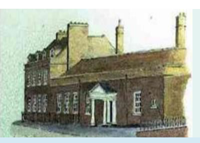
Above: Newmarket Masonic Hall

Further Courts in the Province of East Anglia were consecrated between 2006-2012 in Lowestoft, King's Lynn, Ipswich, Luton, Diss and Whittlesey, this rapid expansion mirroring the growth of the Order itself.